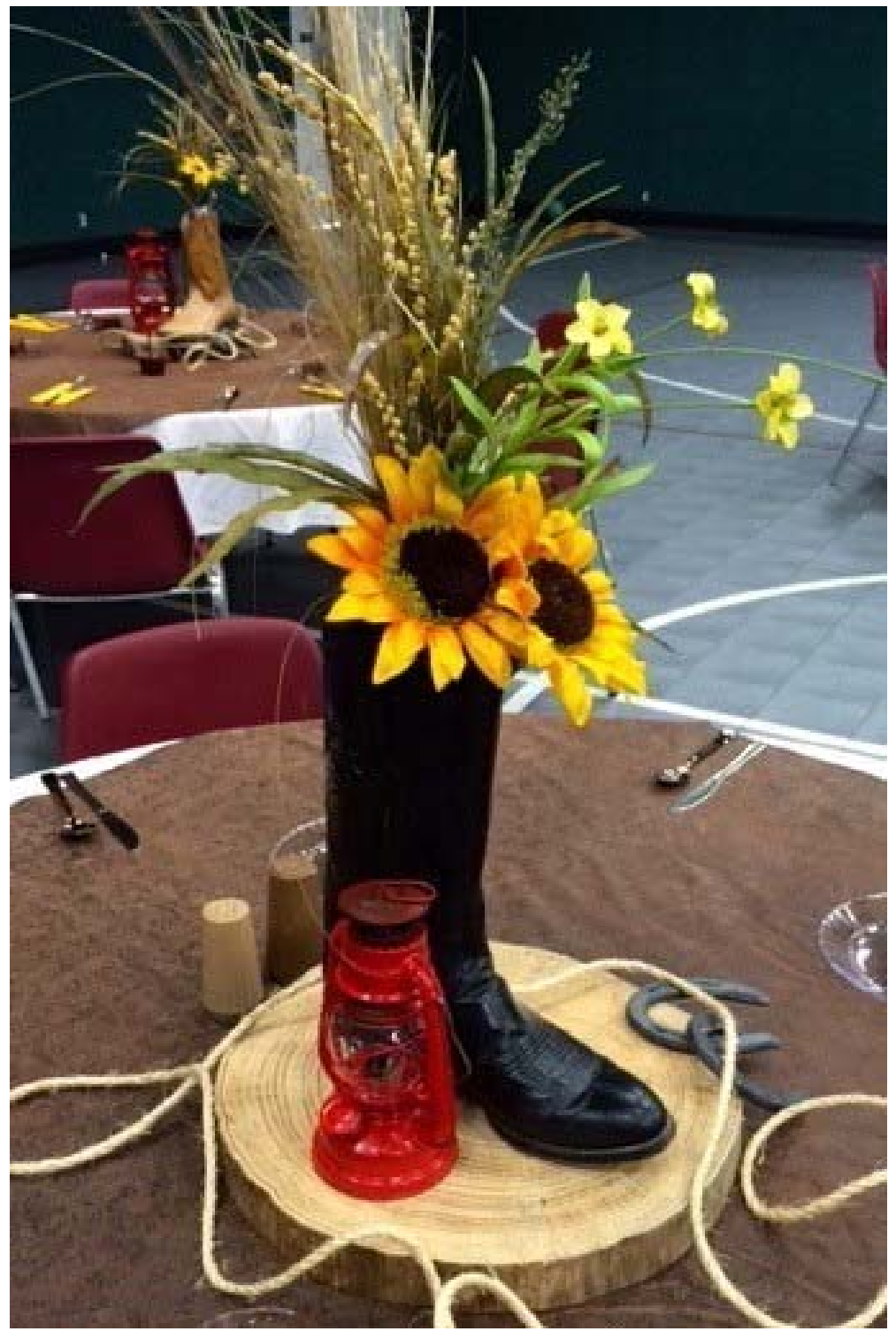
Simple idea for western decorations