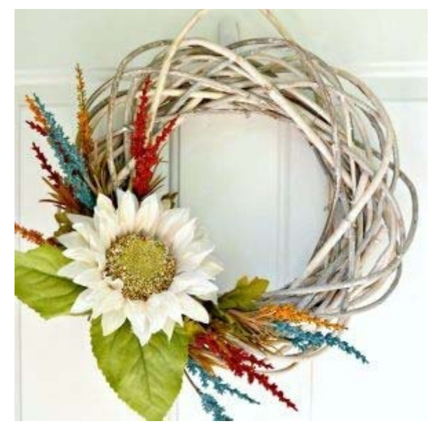
A VERY SIMPLE FALL WREATH IDEA ("REAL HOUSEMOMS" WEB SITE)