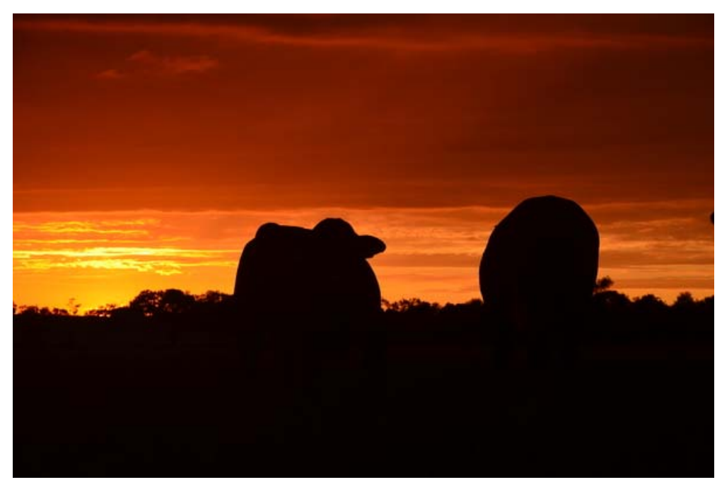
Enjoying the view.