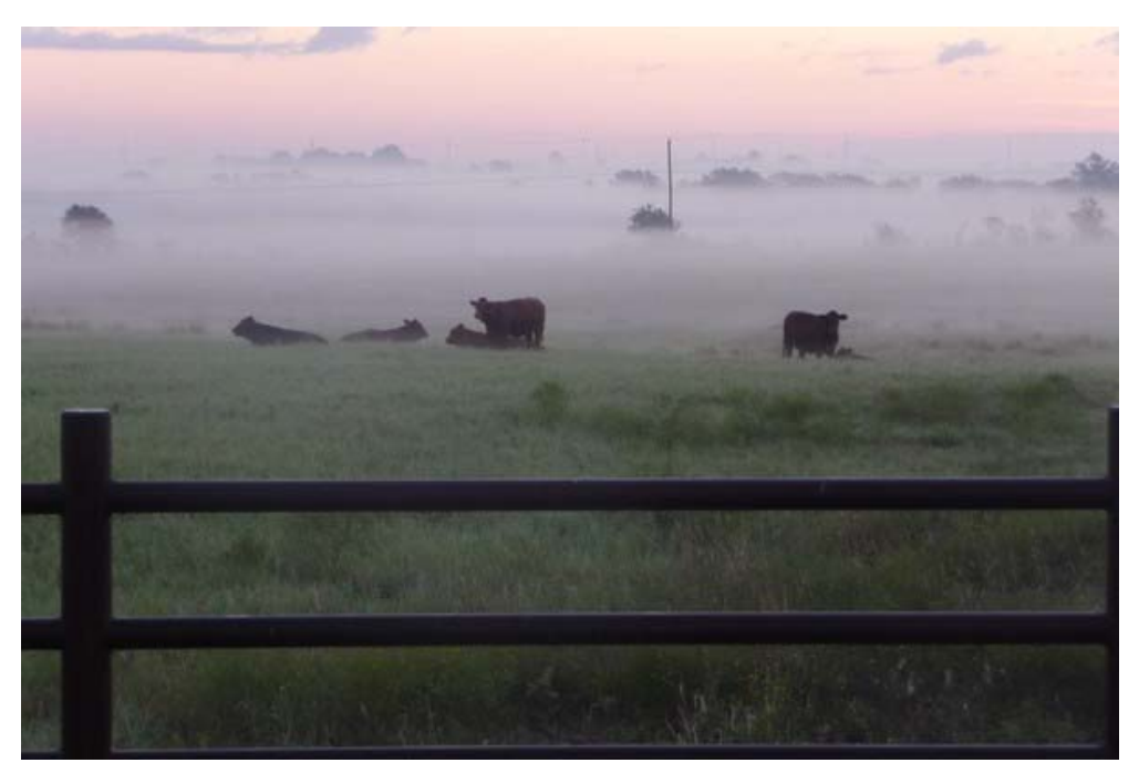
Foggy Day for the Beefmaster herd.