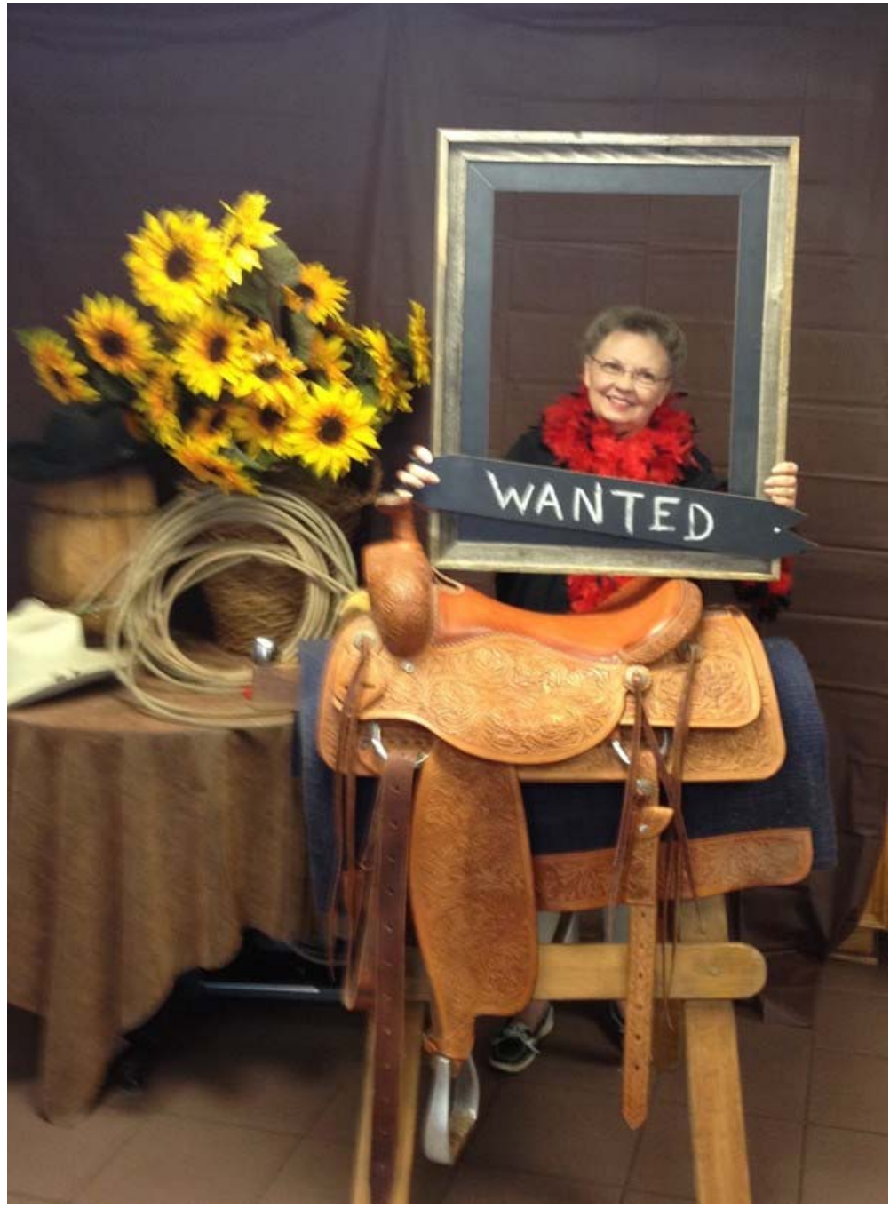
Great idea for a western themed photo booth!